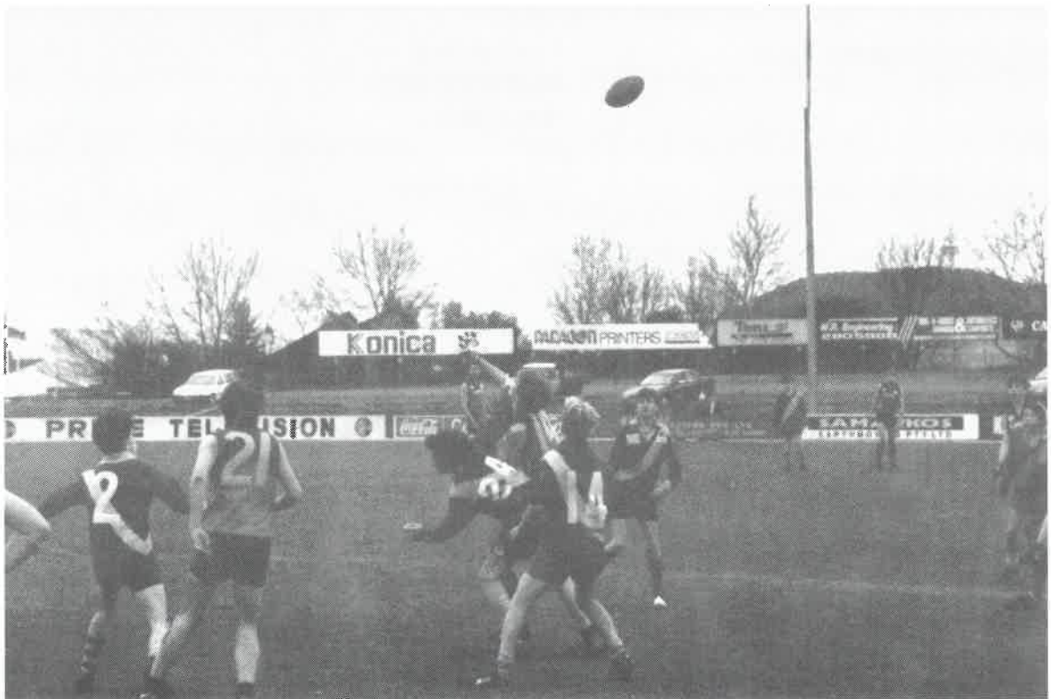
Lions and Marist games always lead to great competition