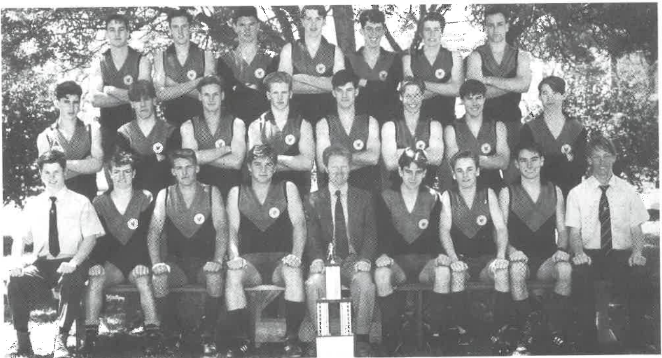
1993 U/18 Premiers