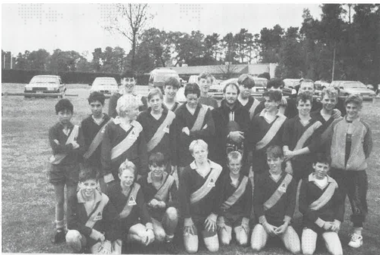
Under 14 Team - 1992