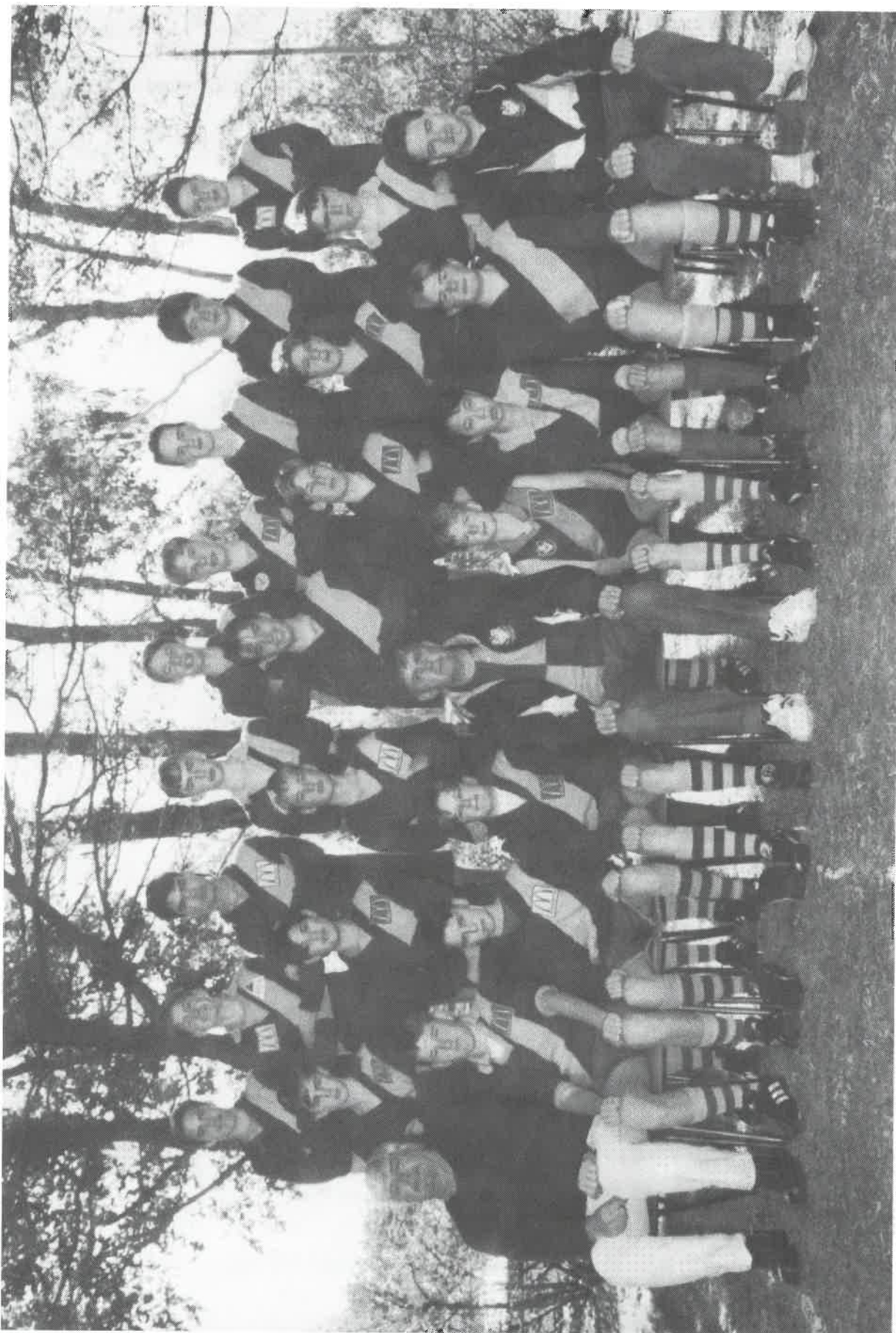
1997 U/14 Premiers