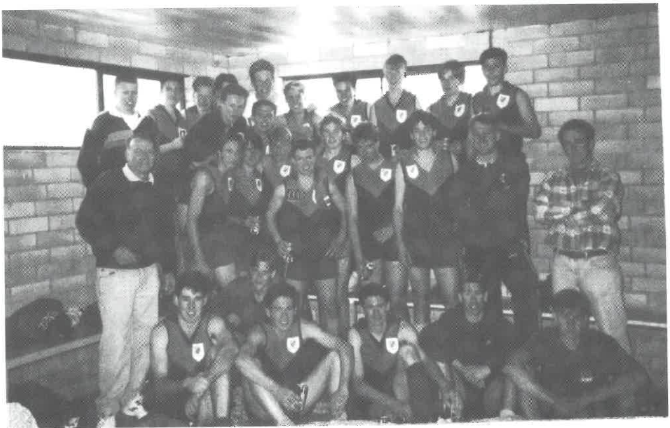
How these boys have 'grown and matured' under the watchful eye of "Godfather Tom"!!!!